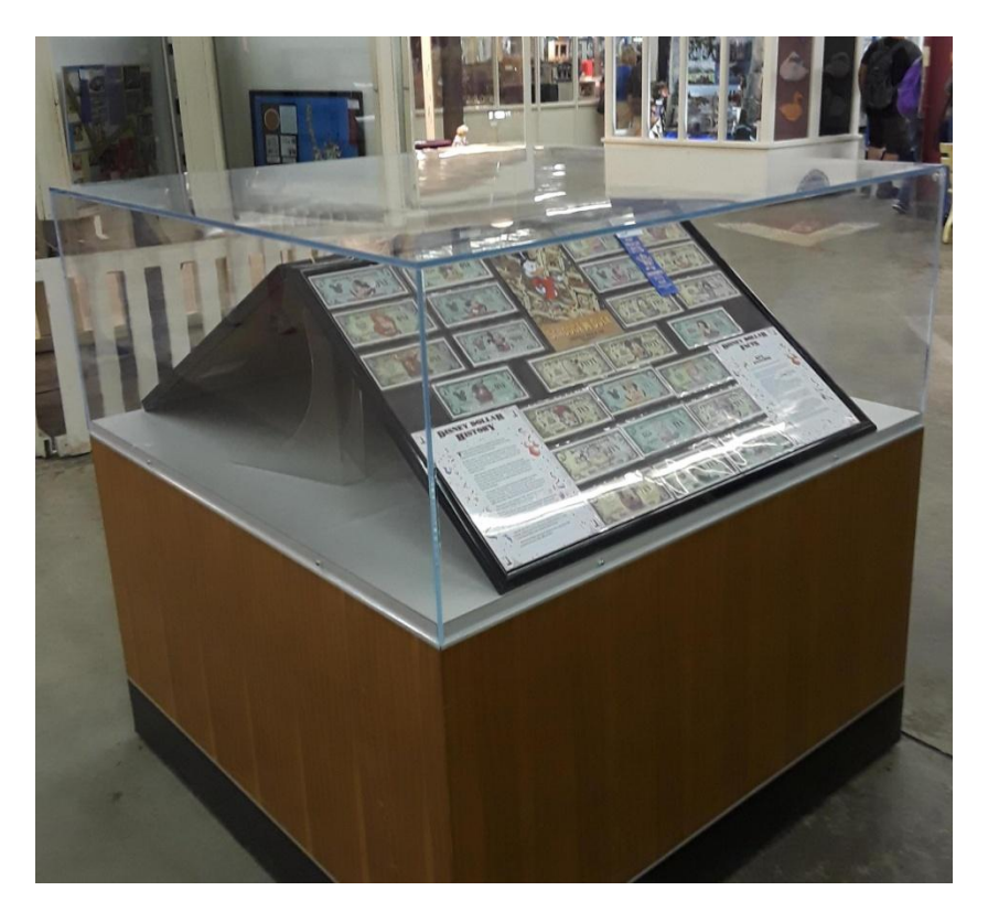
This exhibit of Disney Dollars took first place in the paper money category.