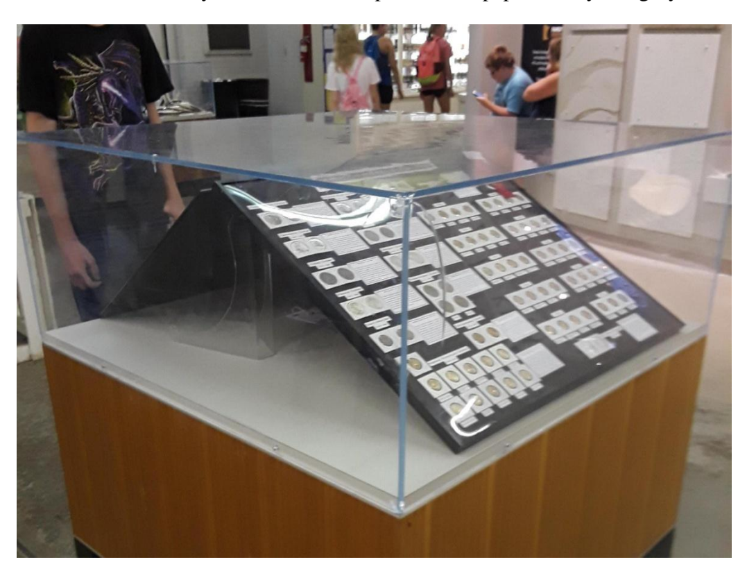
An exhibit of United States dollar coins took second place in the coins category.